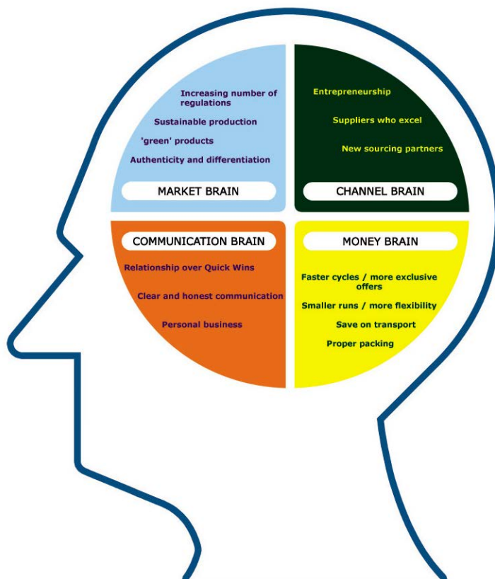
Figure 2: A buyer considers several aspects in the sourcing process. Do the products fit the market? Does sourcing from this company fit with the rest of the channel? Does communication with the supplier run smoothly? And is the price right?

Finally, sending samples to your potential buyers will in many cases be part of the process. When you send samples, make sure they are representative of the batches or lots you will deliver. If you receive an order, deliver the same quality as your samples. If it is not possible, inform your buyers of that to avoid them returning your products and creating a negative image of your company.